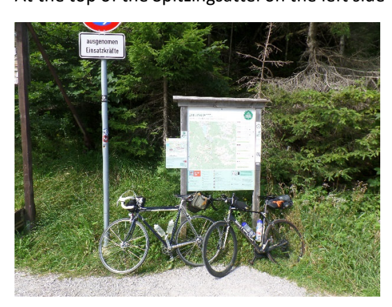
Photo in front of the hiking sign "Spitzingsattel At the top of the Spitzingsattel on the left side