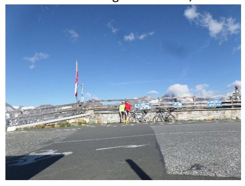
Photo in front of sign "Welcome, Welcome Edelweißspitze" in front of viewing platform