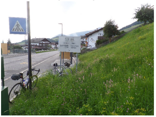
Photo in front of sign "Partnergemeinden Edermünden - Terenten", shortly before Cafe Sonne