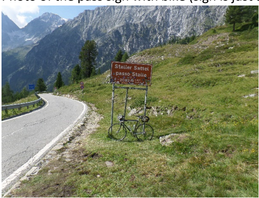
Photo of the pass sign with bike (sign is just after the traffic light, already a bit in the descent)