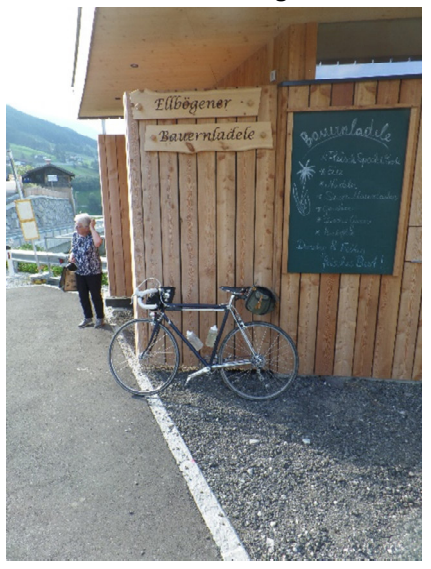
Photo in front of "Ellbögener Bauernlädele" on the left, municipal office on the right.