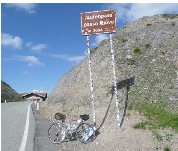
Foto with pass sign