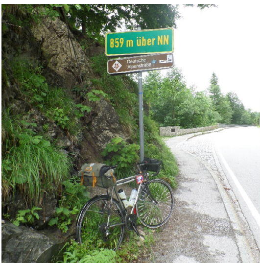
Foto at NN sign