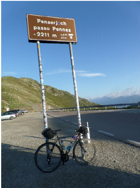
Foto with pass sign