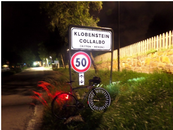
Foto with sign Klobenstein.