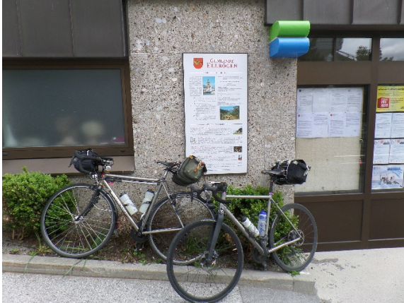
Photo in front of history board of the municipality Ellbogen at the municipal office St. Peter