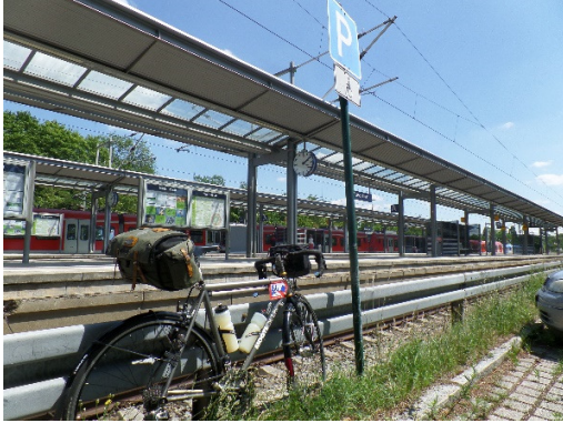
Foto with station clock