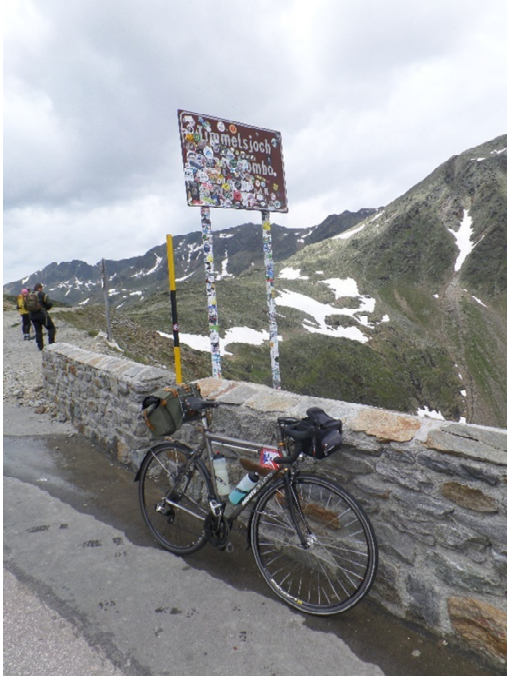
Foto with pass sign