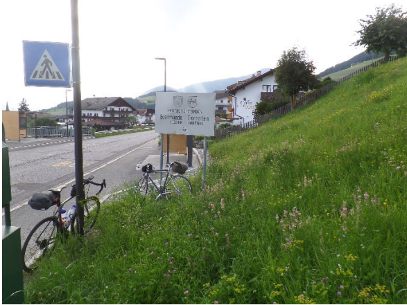
Photo in front of sign "Partnergemeinden Edermünden - Terenten", shortly before Cafe Sonne