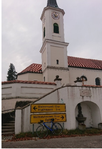
Photo in front of traffic sign at intersection with church clock

From Endlhausen to Deisenhofen it is 10 flat kilometres