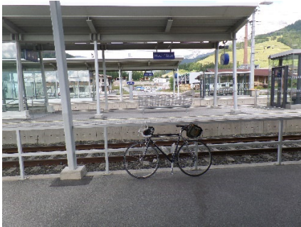
Photo on platform Hochfilzen