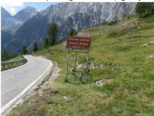
Photo of the pass sign with bike (sign is just after the traffic light, already a bit in the descent)