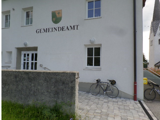
Photo in front of the municipal office