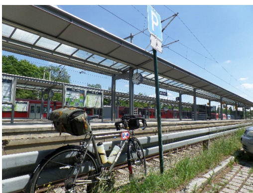
Photo with station clock