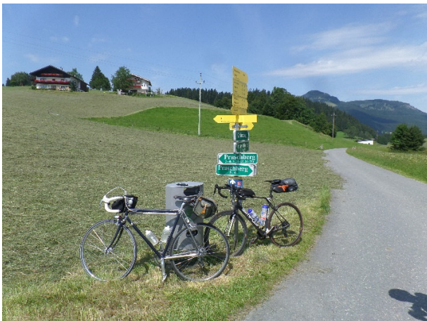
Photo of signpost at top after ascent to Prashber/Neudorfer Berg.