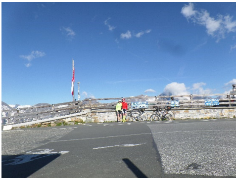
Photo in front of sign "Welcome, Welcome Edelweißspitze" in front of viewing platform