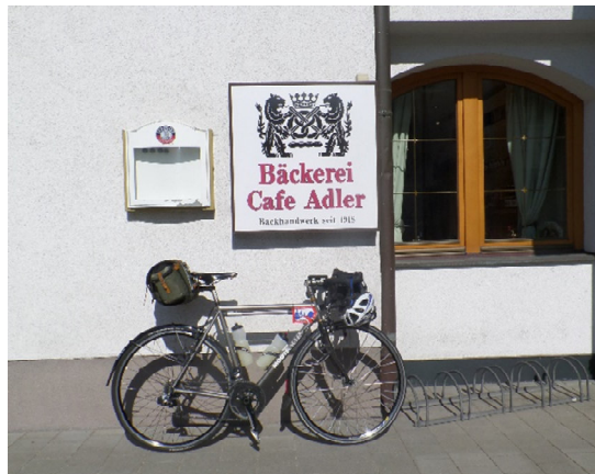
Photo in front of Bakery/Cafe Adler