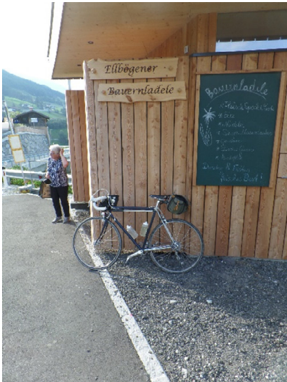
Photo in front of "Ellbögener Bauernlädele" on the left, municipal office on the right.